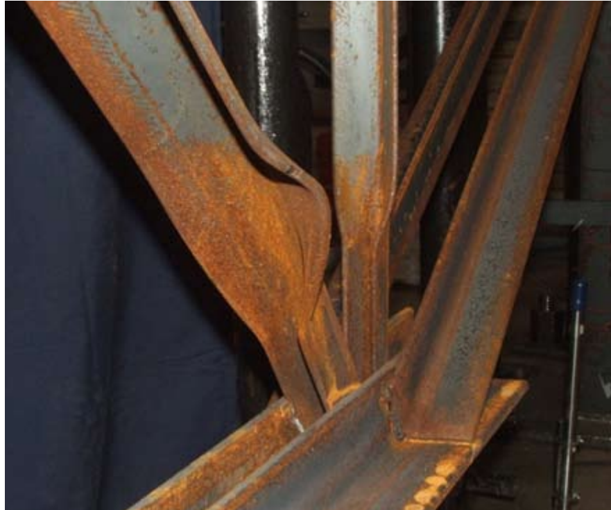
▲ Crimped angles and crimped angle local web buckling.

Several specific changes relative to the design of OWSJ are contained in the new Specification . Many of these changes do not directly affect the specifier; however, the changes provide greater reliability in the design of the joist. Of significance is a new design procedure for the first primary compression