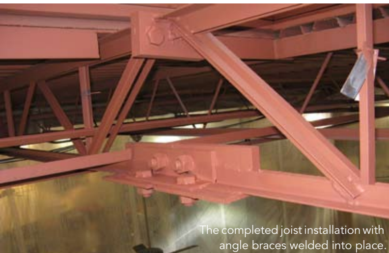
The completed joist installation with angle braces welded into place.