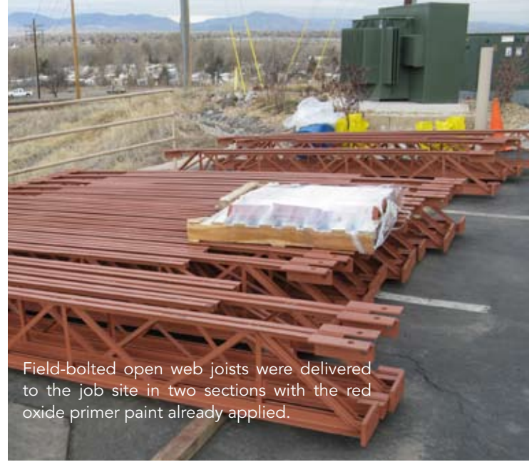
Field-bolted open web joists were delivered to the job site in two sections with the red oxide primer paint already applied.

Field-bolted spliced open-web steel joists can be manufactured to any standard joist size and are shipped from the manufacturer in two segments. The joists are field-bolted with a moment splice that can be designed to be almost anywhere along the joist. Adjusting the splice location can help accommodate an existing duct or fire suppression line that otherwise would have to be temporarily disconnected or rerouted to install a standard joist.